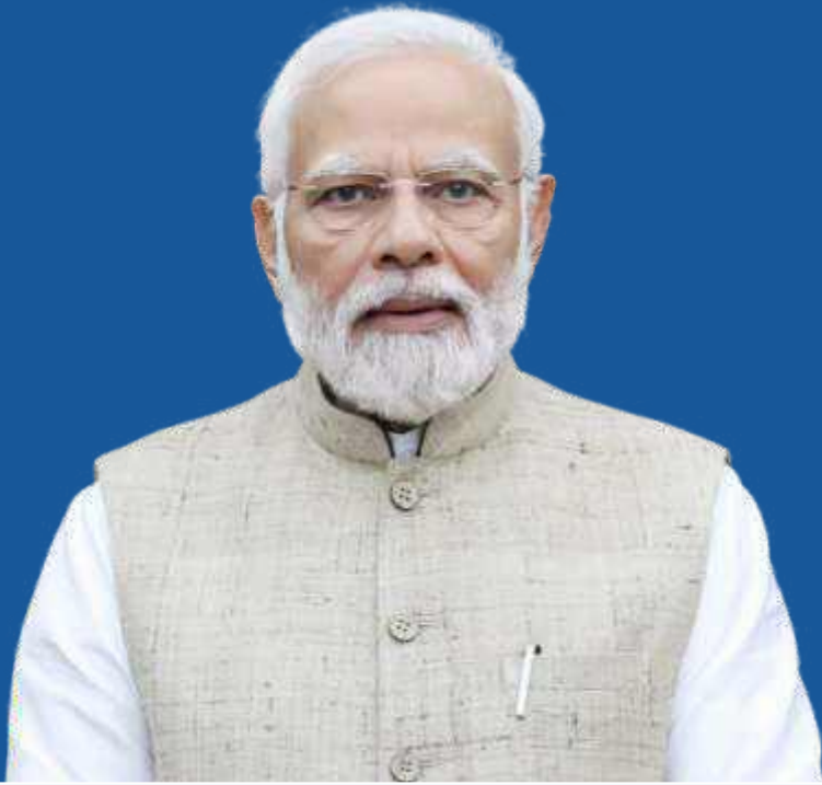
Shri Narendra Modi Hon'ble Prime Minister of India