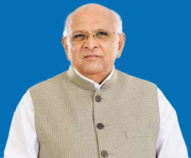
Shri Bhupendrabhai Patel Hon'ble Chief Minister of Gujarat