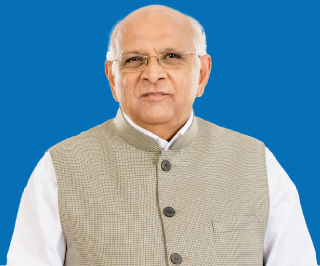
Shri Bhupendrabhai Patel Hon'ble Chief Minister of Gujarat